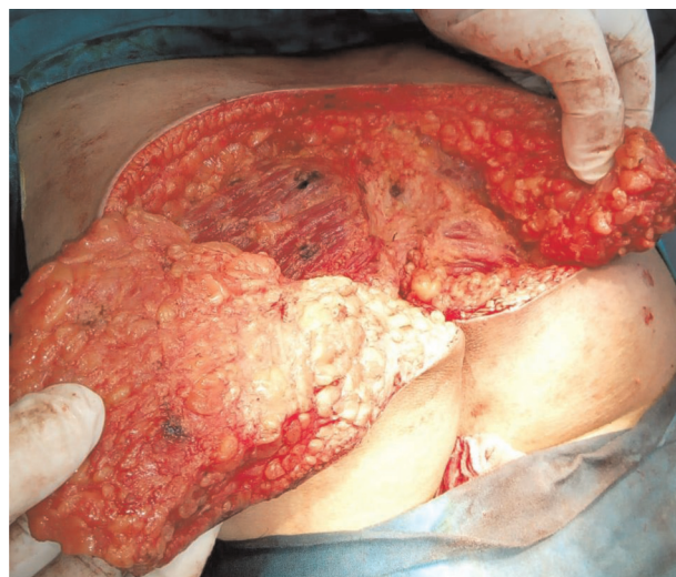
The flap was released off the gluteus maximus muscle.