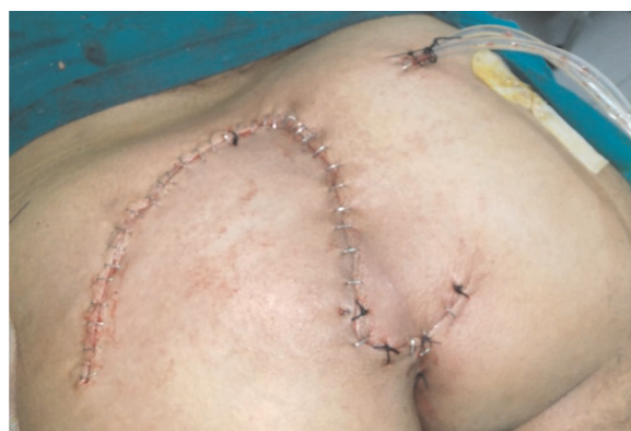
Closure of the defect with the flap.

The mean operative time was 55.0±8.16 min (range, 45.0–70.0 min). All patients were discharged within 24 h postoperatively. The mean visual analog scale for the postoperative pain on the first day was 6.38±1.15 (range, 5.0–8.0). The mean time to return to normal daily activities was 2.55±0.68 days (range, 2.0–4.0 days), whereas the mean time to return to work was 2.91±0.87 weeks. The mean time for toilet sitting was 11.53±1.55 days (range, 10–14), whereas the mean time for drain removal was 15.2±3.77 days (10.0–20.0 days) and the mean follow-up was 14.95 ±3.2 months (range, 10.0–18.0 months). Major complications were not detected; however, there was seroma in five (12.5%) patients. Surgical-site infection developed in three (7.5%) patients. There were three (7.5) cases of partial flap necrosis, one (2.5) case of flap dehiscence, one (2.5) case of hematoma, and three (7.5) cases of loss of sensation of skin over the flap. The