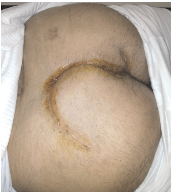
Flap appearance 3 weeks after the operation.

overall postoperative complications were managed conservatively. One (2.5%) patient had a recurrence in the second year of the follow-up.