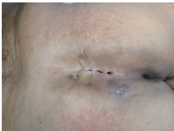
Complex sacrococcygeal pilonidal sinuses and cysts.

Methylene blue was injected into the sinuses. Surgical excision of the complex sacrococcygeal pilonidal sinuses and cysts, involving complete natal cleft excision, reaching presacral fascia, was undertaken (Figs 3 and 4). The gluteal fasciocutaneous rotation flap was tailored by a curvilinear incision and released off the gluteus maximus muscle (Figs 5 and 6). The wound was closed on a vacuum drain that was removed when the drainage was 50 ml or less per day (Fig. 7). The patients were advised to avoid sitting and tension on the flap. The skin clips were removed on the 12th postoperative day.