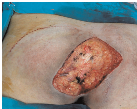
Excised sacrococcygeal pilonidal sinus.