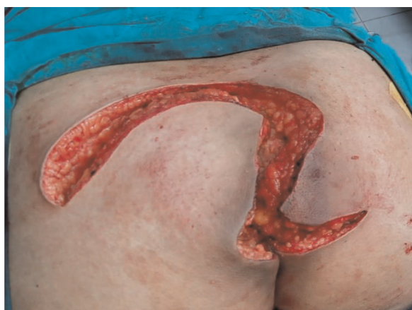
Curvilinear incision for the gluteal fasciocutaneous rotational flap.