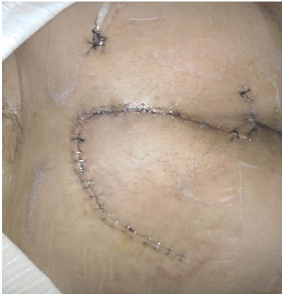
Flap appearance 1 week after the operation.